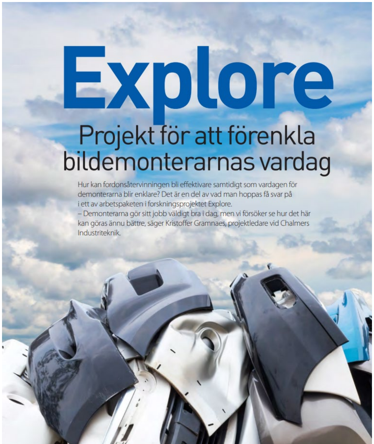
Figure 5: Popular scientific article in NBÅ number 2, 2017.