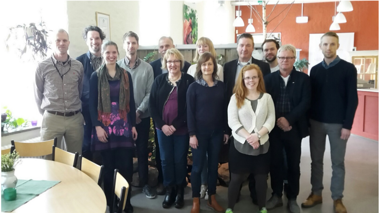
Figure 2: Kick-off meeting in Ekocentrum, Gothenburg, April 29 th , 2016.