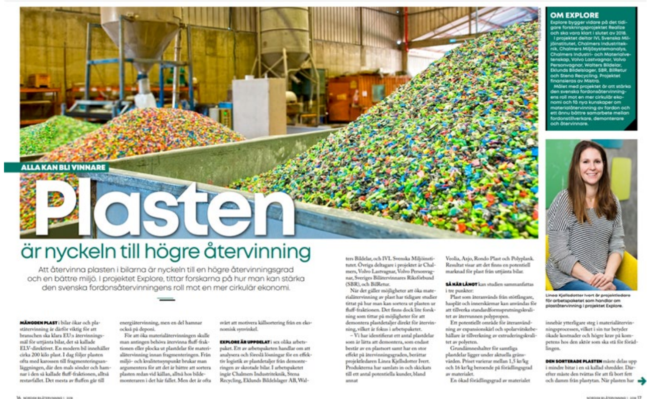
Figure 6: Popular article in Nordisk Bilåtervinning number 1, 2018.

Plasten i bilarna är nyckeln till en högre återvinningsgrad. NBÅ nummer 1, 2018. http://www.sbrservice.se/wp-content/uploads/NBA%CC%8A-nr-1-2018-lr.pdf