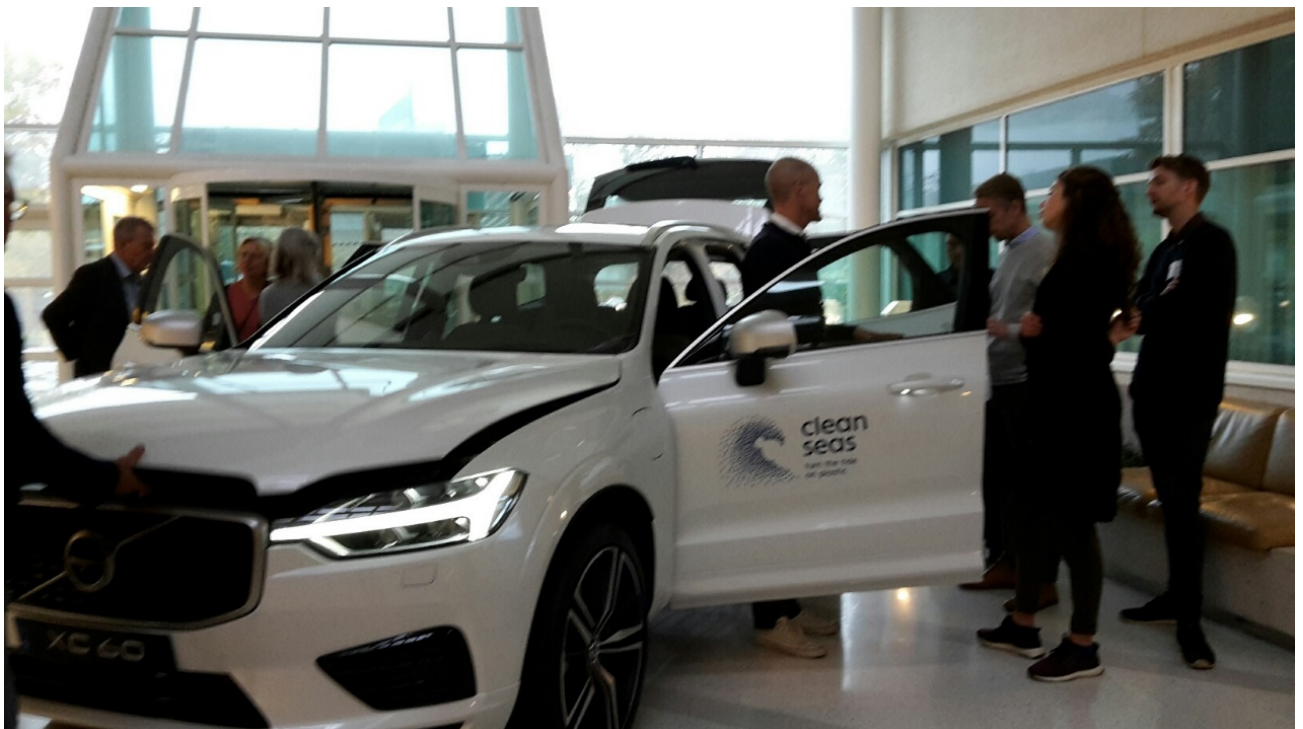
Figure 3: Taking a look at the Volvo concept car with over 20% recycled plastics at the project meeting in October 2018.