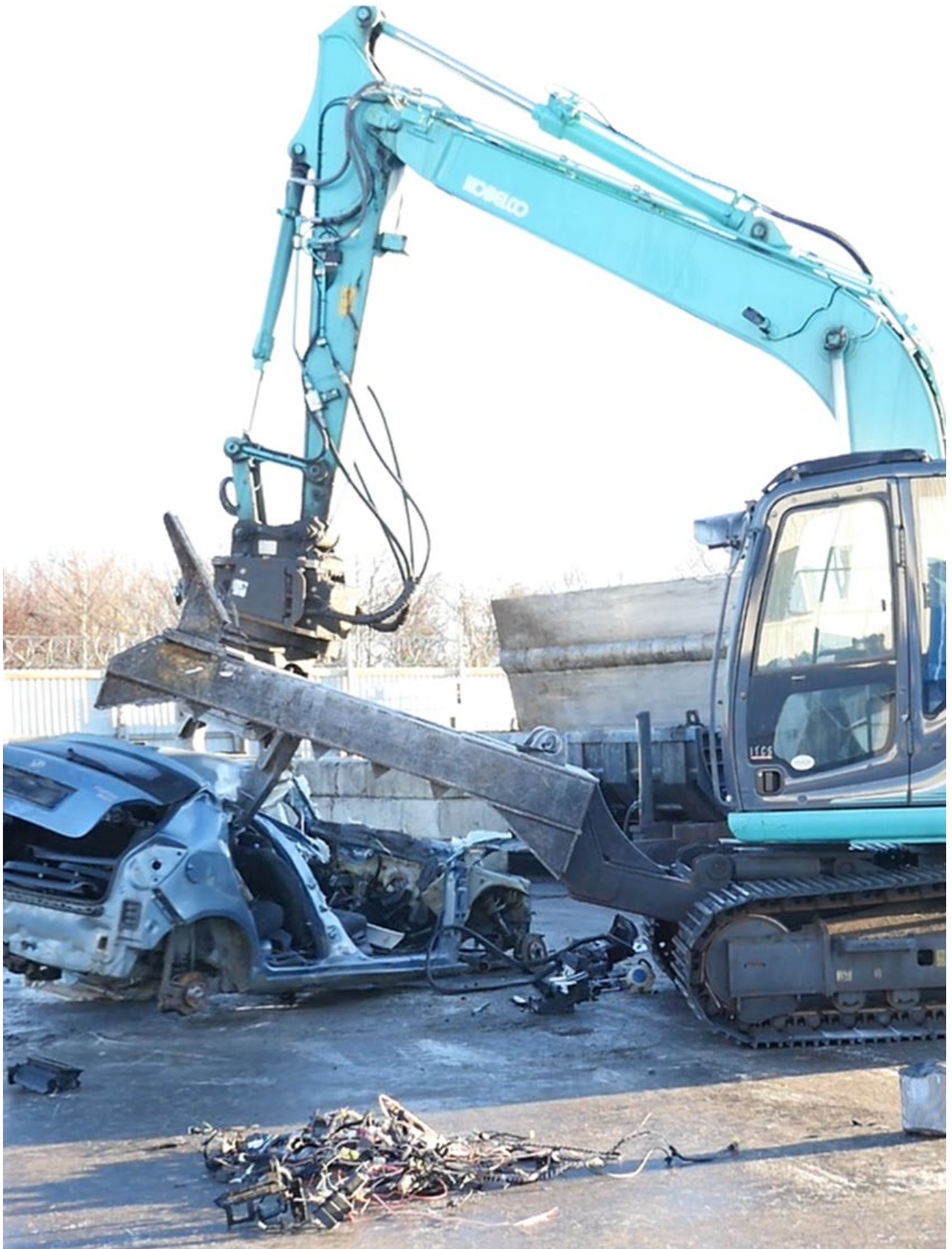
Figure 4: Example of advanced material handling of ELV:s, available only at a few large dismantlers in Sweden today.