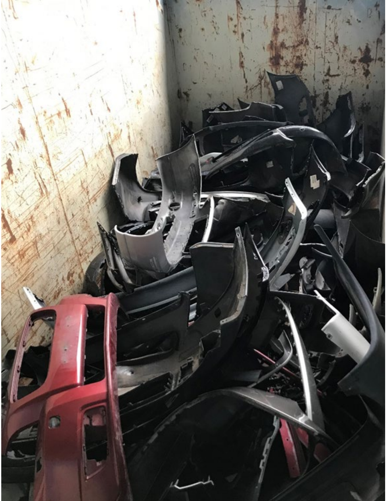
Figure 7: Bumper skins collected in the follow up project “Cirkulär fordonsplast”.